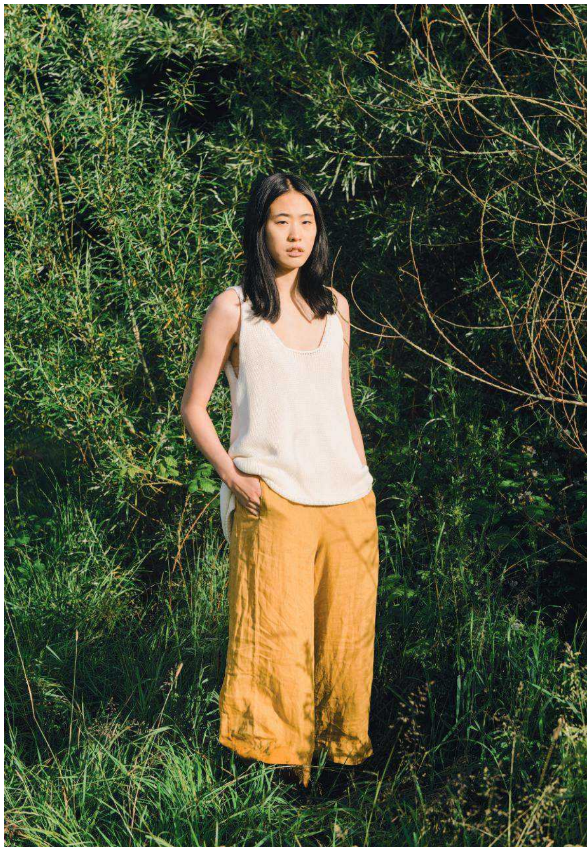
STELLA ORGANIC COTTON VEST IN OFF WHITE Also available in Navy and Sun. NICOLE-MAY LINEN TROUSERS IN SUN Also available in Bone and Midnight.