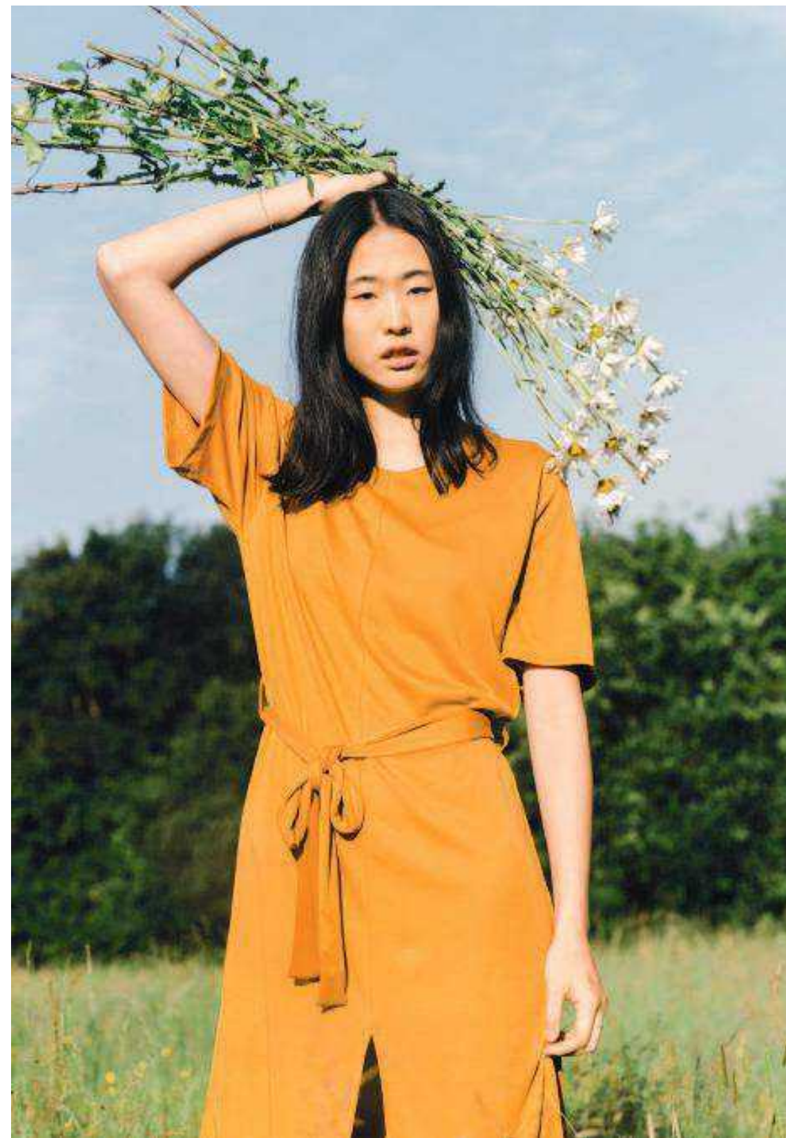
JULIET-LOU LYOCCELL DRESS IN BRONZE Also available in Light Grey Marl and Midnight.