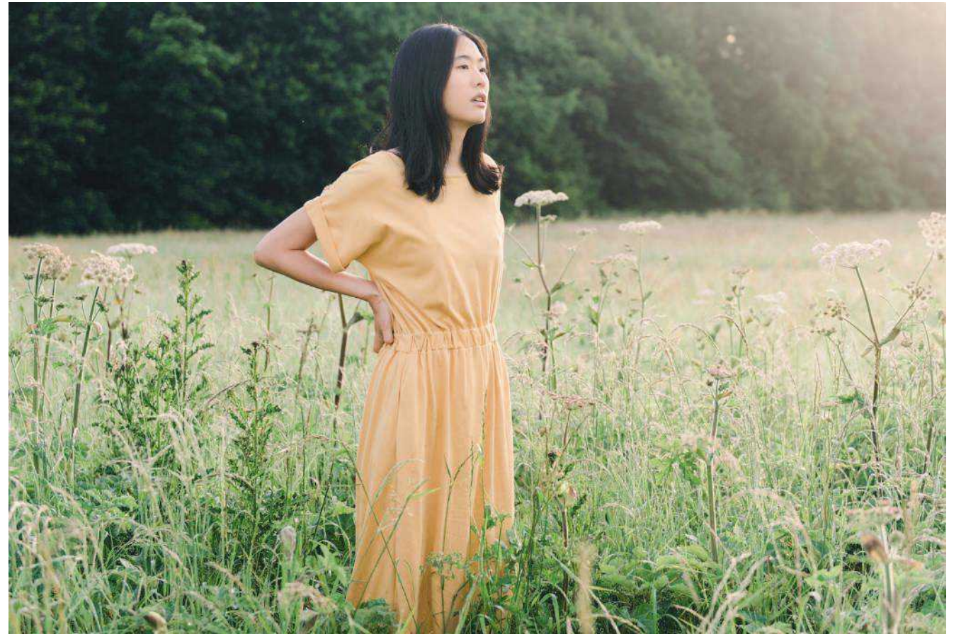
MARISSA ORGANIC COTTON DRESS IN HONEY Also available in Bone, Bronze, Midnight.