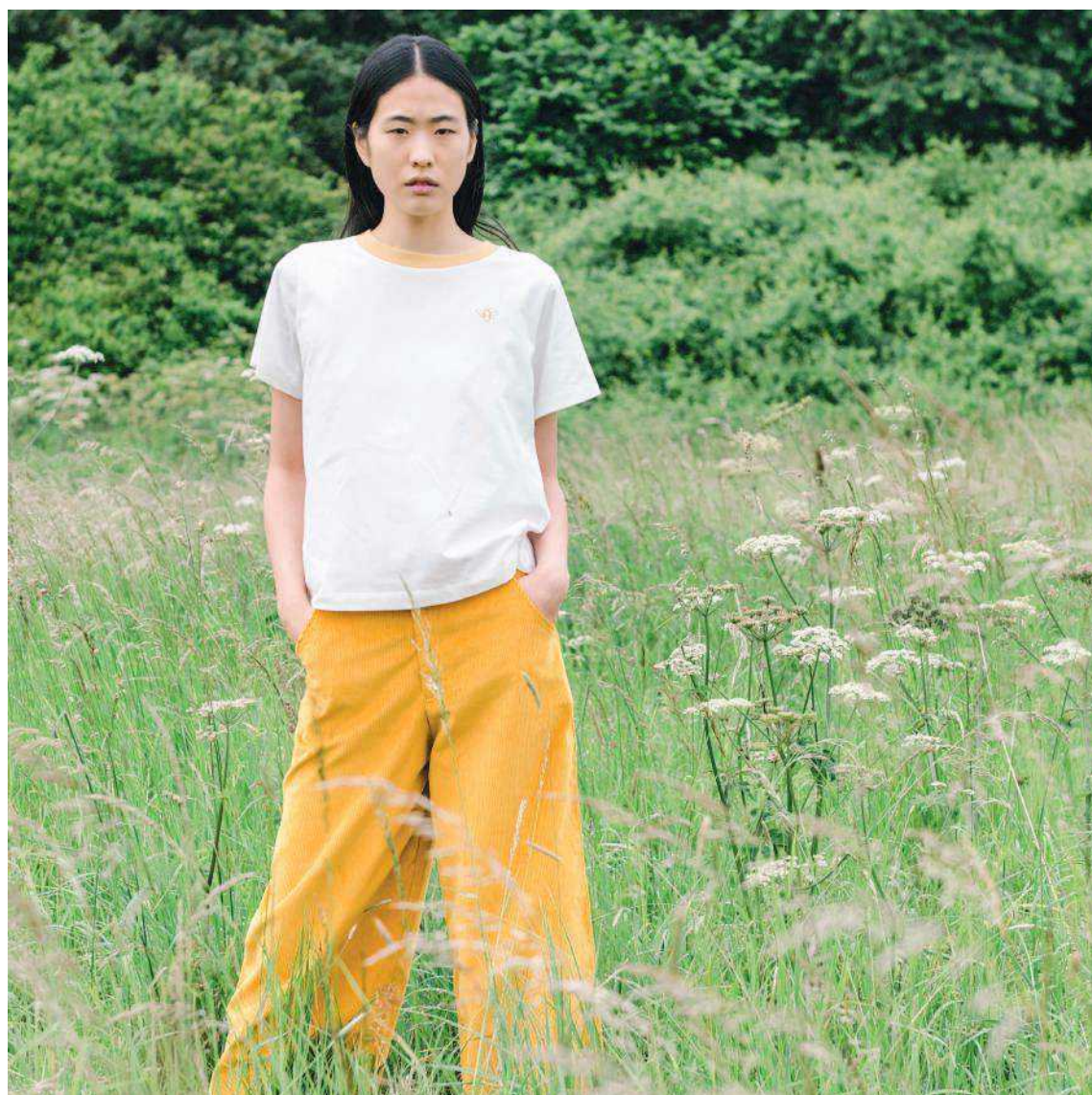
BUMBLEBEE ORGANIC COTTON TSHIRT IN WHITE & HONEY Also available in White. TRACEY ORGANIC COTTON CORDUROY TROUSERS IN SUN Also available in White and Slate.