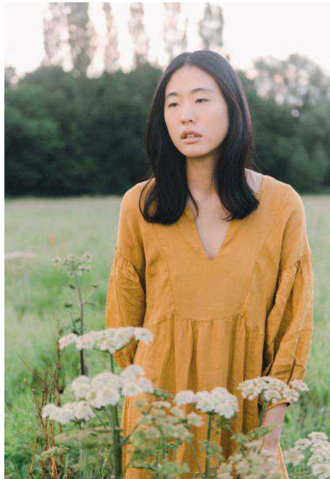
ANDREIA-MAY LINEN DRESS IN SUN Also available in Bone and Midnight.