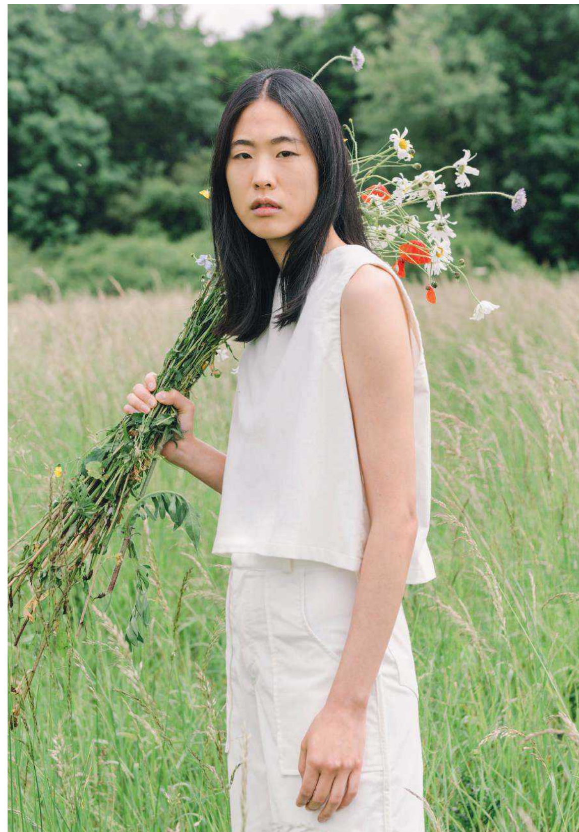
ALBER ORGANIC COTTON CORDUROY TOP IN WHITE Also available in Slate and Sun. TRACEY ORGANIC COTTON CORDUROY TROUSERS IN WHITE Also available in Slate and Sun.