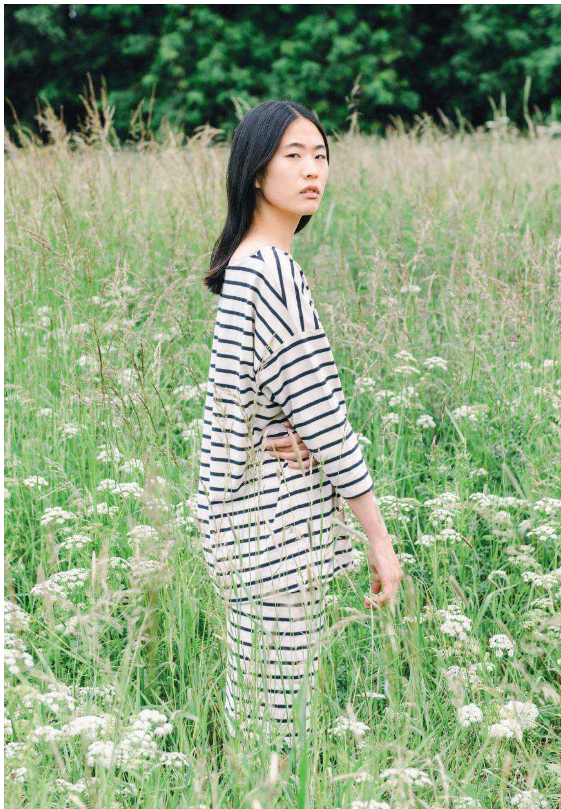
MAFALDA-SUE ORGANIC COTTON TOP IN BONE MARL & BLACK Also available in Midnight & Natutral ADDISON-SUE ORGANIC COTTON SKIRT IN BONE MARL & BLACK Also available in Midnight & Natutral