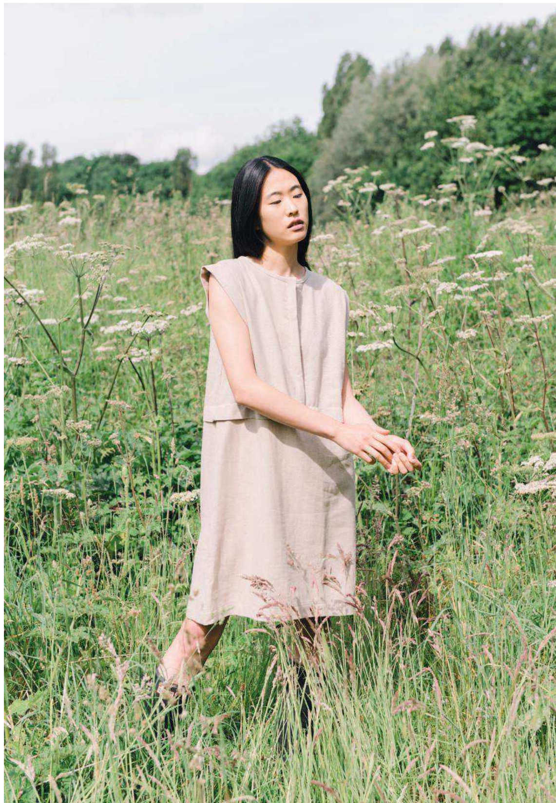
ADELE LINEN DRESS IN NATURAL Also available in Black