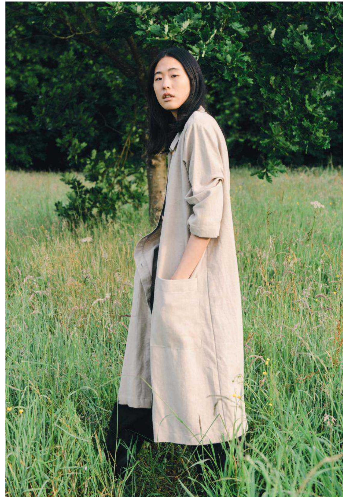
ABBEY LINEN COAT IN NATURAL Also available in Black