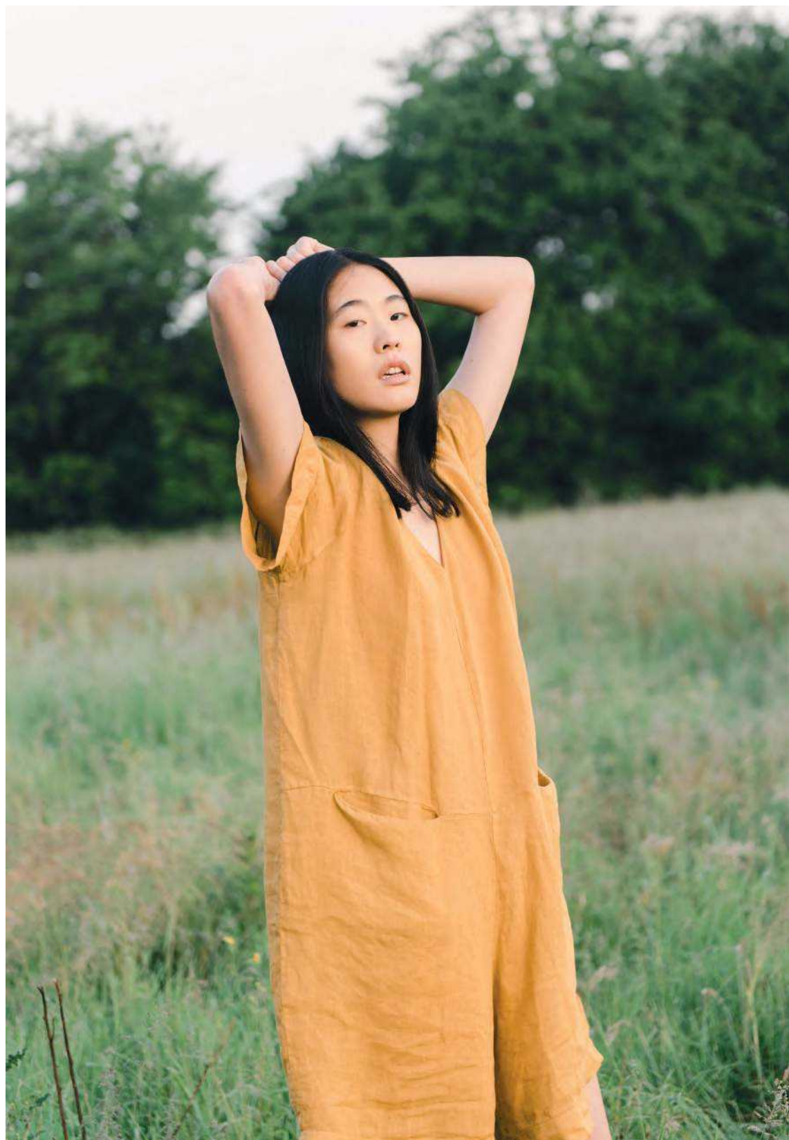
NOVA LINEN PLAYSUIT IN SUN Also available in Bone and Midnight.