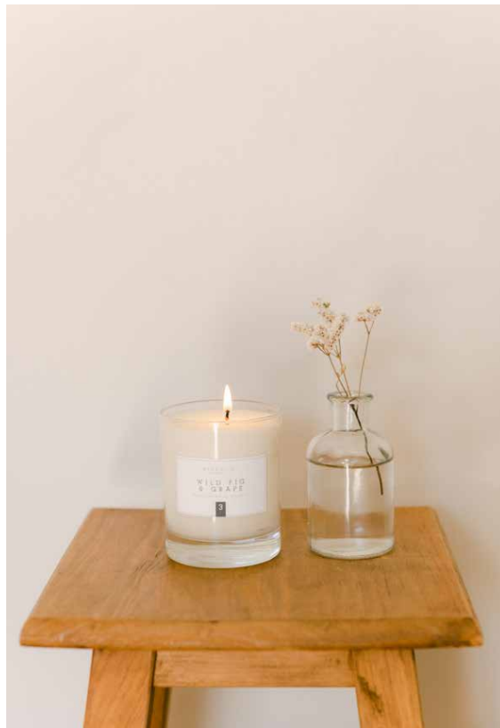
30CL CANDLE IN WILD FIG & GRAPE Also available in Limeleaf & Ginger, Rhubarb & Ginger, Sandalwood, Black Pomegranate, and Aloe, Straw & Cucumber