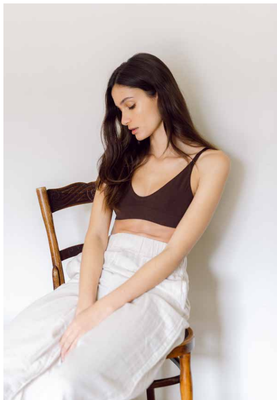
ILZE ORGANIC COTTON BRA IN CHOCOLATE Also available in Black, Navy, Tan and Nude EVORA ORGANIC COTTON TROUSERS IN BONE Also available in Chocolate, Tan, Plum, Navy and White