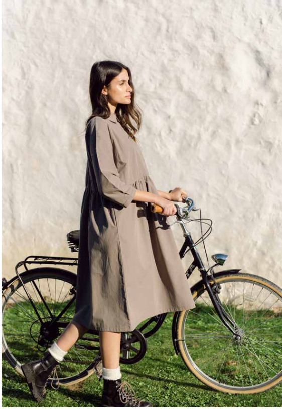
MARGE ORGANIC COTTON DRESS IN OLIVE Also available in Black PREVIOUS: MIRABELLE ORGANIC COTTON DRESS IN NAVY Also available in Camel and Army