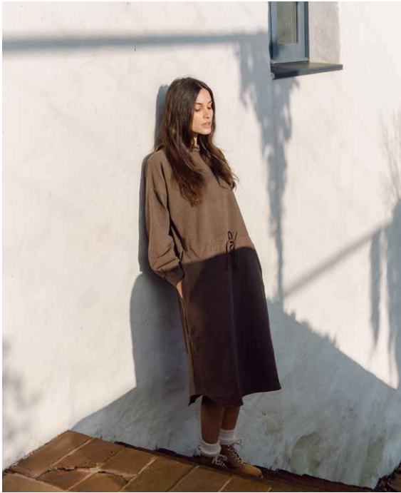
BRIDGET ORGANIC COTTON DRESS IN BROWN MARL Also available in Black and Pistachio