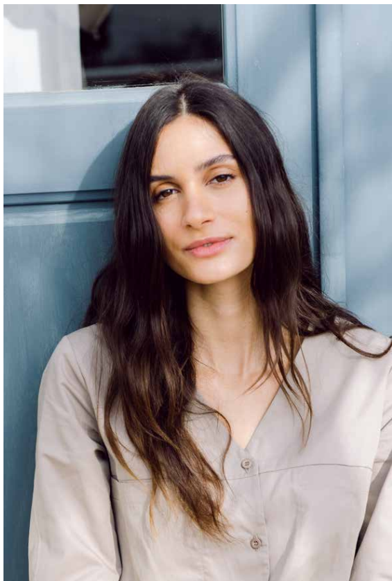
DIANA ORGANIC COTTON AND TENCEL JUMPSUIT IN TAUPE Also available in Black