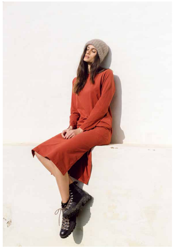
ABOVE: RAINA ORGANIC COTTON DRESS IN RUST Also available in Navy and Olive