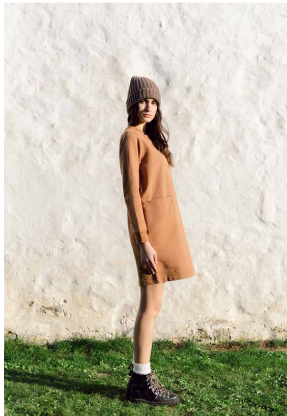
ALEXIS ORGANIC COTTON DRESS IN TAN Also available in Navy and Plum & Navy GISELLE VIRGIN WOOL HAT IN BROWN Also available in Dark Grey Marl , Tan and Beige