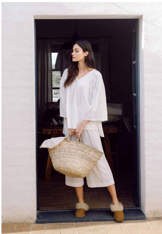
CARLOTTE ORGANIC COTTON TOP IN OFF WHITE Also available in Bone, Plum, Chocolate, Tan and Navy EVORA ORGANIC COTTON TROUSERS IN OFF WHITE Also available in Bone, Plum, Chocolate, Tan and Navy BAHRYA STRAW BASKET | RUBY SHEEPSKIN SLIPPERS