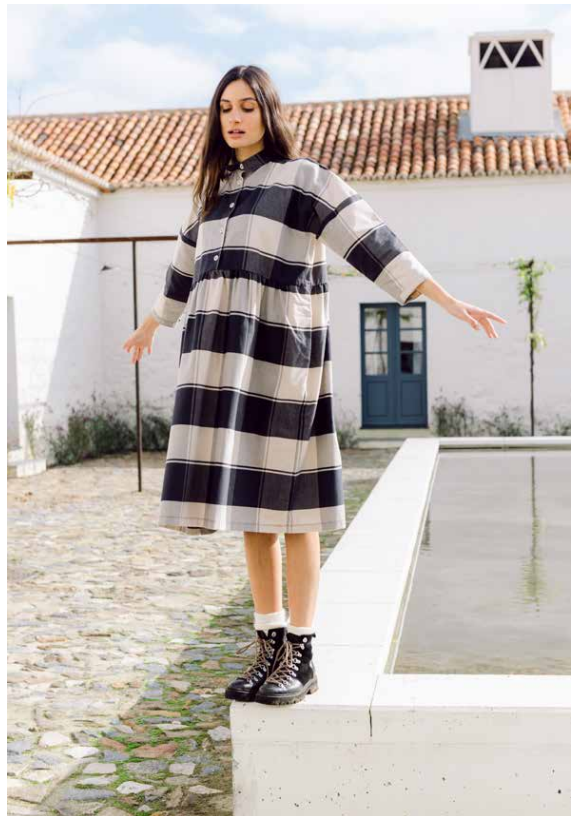
MARGE-CAY ORGANIC COTTON DRESS IN NAVY & BEIGE CHECK