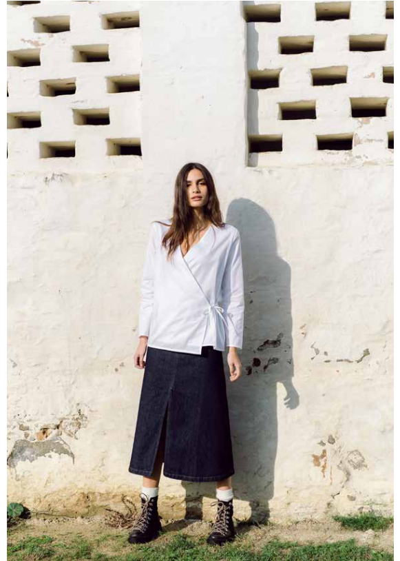
ARLEY ORGANIC COTTON TOP IN WHITE Also available in Black and Chocolate SHELBY ORGANIC COTTON DENIM SKIRT IN INDIGO Also available in Black and Army