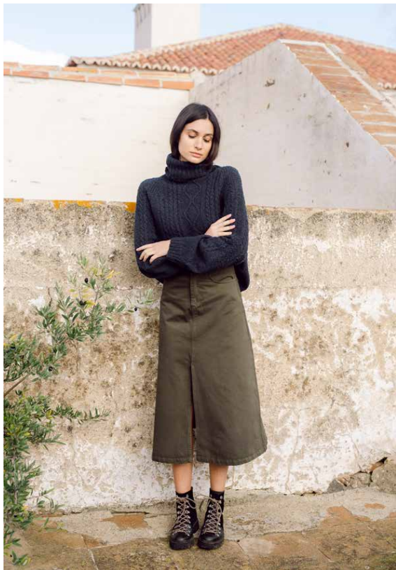
DAVINA LAMBSWOOL JUMPER IN NAVY Also available in Cream and Oat SHELBY ORGANIC COTTON DENIM SKIRT IN ARMY Also available in Black and Indigo