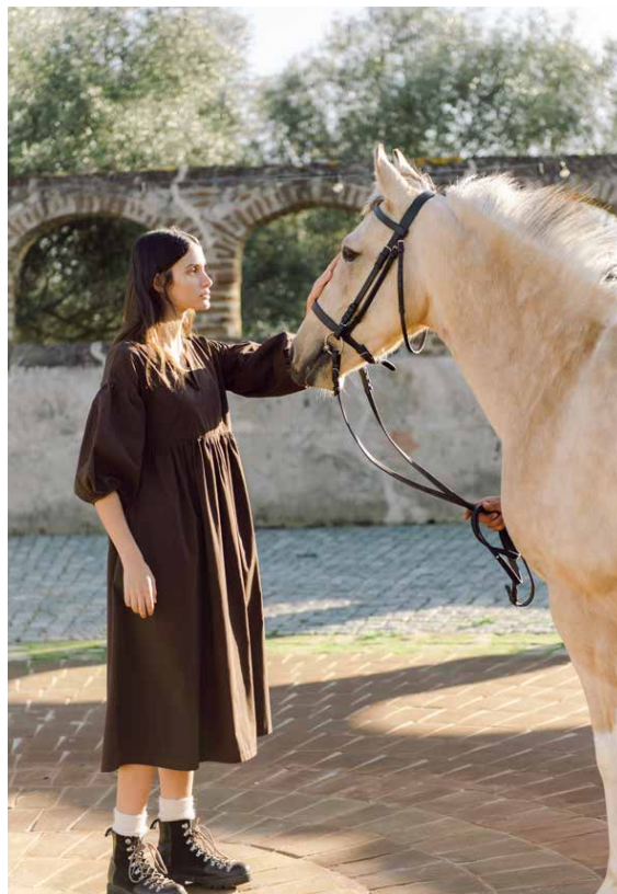
MEILANI ORGANIC COTTON DRESS IN CHOCOLATE Also available in Navy and Olive