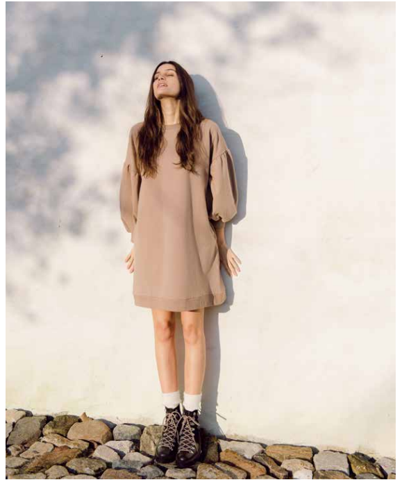
ABIGAIL ORGANIC COTTON DRESS IN MOCHA Also available in Dark Grey Marl and Rust