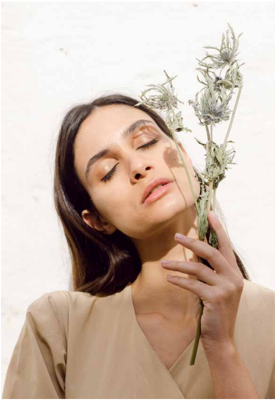
PREVIOUS: ABAM MOSES BASKET BENTO QUILTED BLANKET IN OFF WHITE Also available in Navy, Chocolate, Tan, Plum and Bone OPPOSITE AND ABOVE: GWEN ORGANIC COTTON & TENCEL DRESS IN CAMEL Also available in Black and Taupe