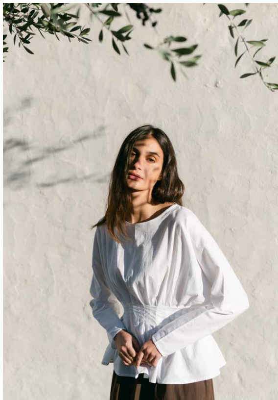
RAQUEL ORGANIC COTTON & TENCEL TOP IN WHITE Also available in Black and Taupe