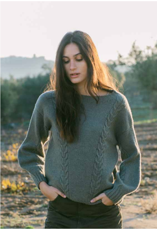
ABOVE: AGGIE LAMBSWOOL JUMPER IN MOSS Also available in Chalk and Brown Sugar