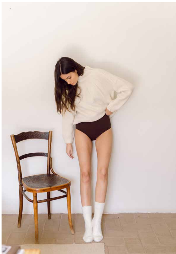
BLANCHE LAMBSWOOL JUMPER IN CHALK Also available in Brown Sugar and Moss ENDIJA ORGANIC COTTON HIGH WAISTED BRIEFS IN CHOCOLATE Also available in Black, Navy, Tan and Nude