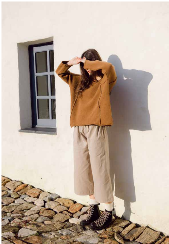
ALESSANDRA-ROSE VIRGIN WOOL JUMPER IN TAN Also available in Dark Grey Marl and Beige ADRIENNE-JANE ORGANIC COTTON & TENCEL TROUSER IN TAUPE Also available in Black and Camel