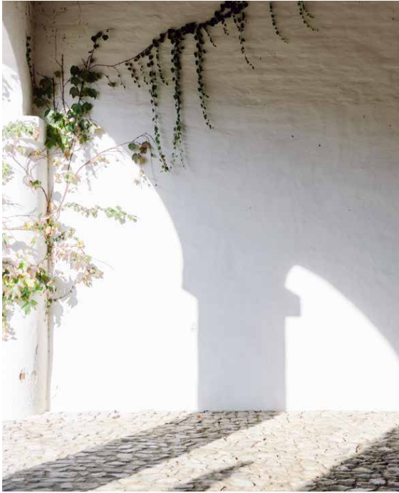
OPPOSITE: RUTH ORGANIC COTTON DRESS IN RUST Also available in Navy and Teal