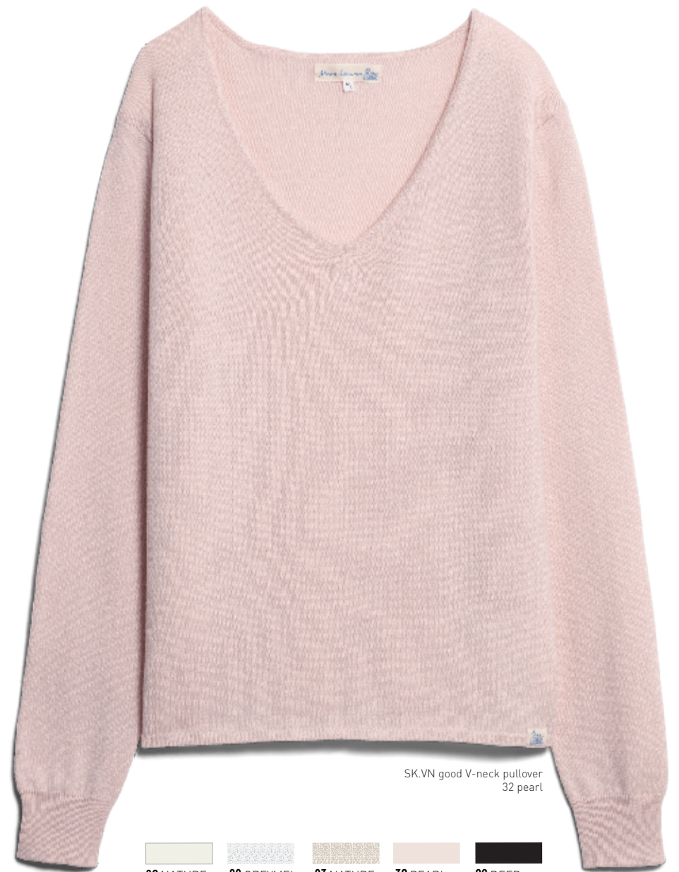
SK.VN good V-neck pullover 32 pearl