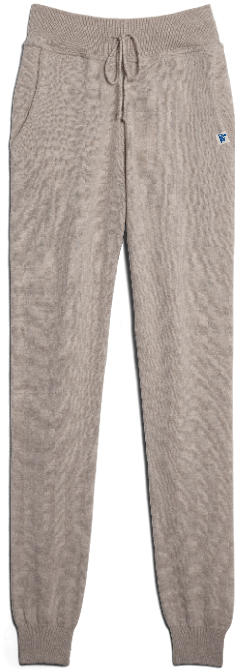
SK. PT good pants 03 nature melange