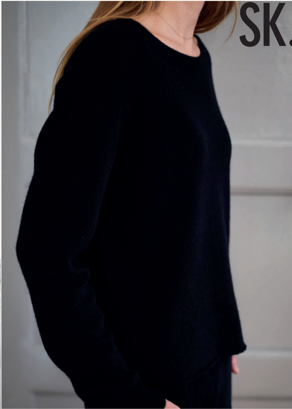
SK.CN good crew pullover / SK.PT pants