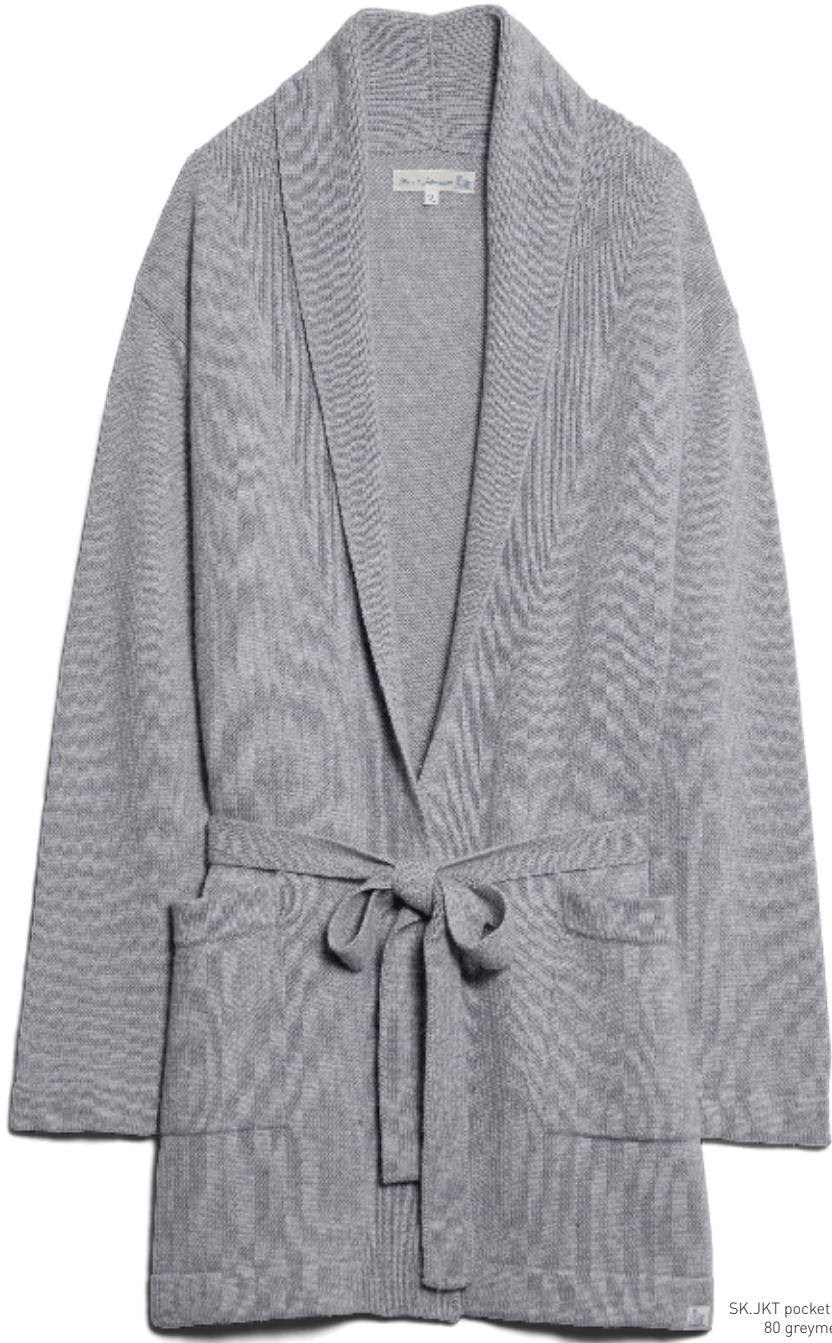
SK.JKT pocket jacket 80 greymelange