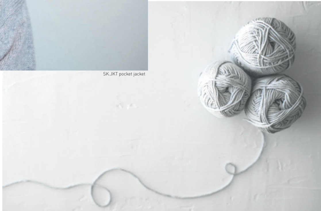
SK.JKT pocket jacket

- sense 15% cashmere, 30% silk, and 55% best merino wool extra-fine -