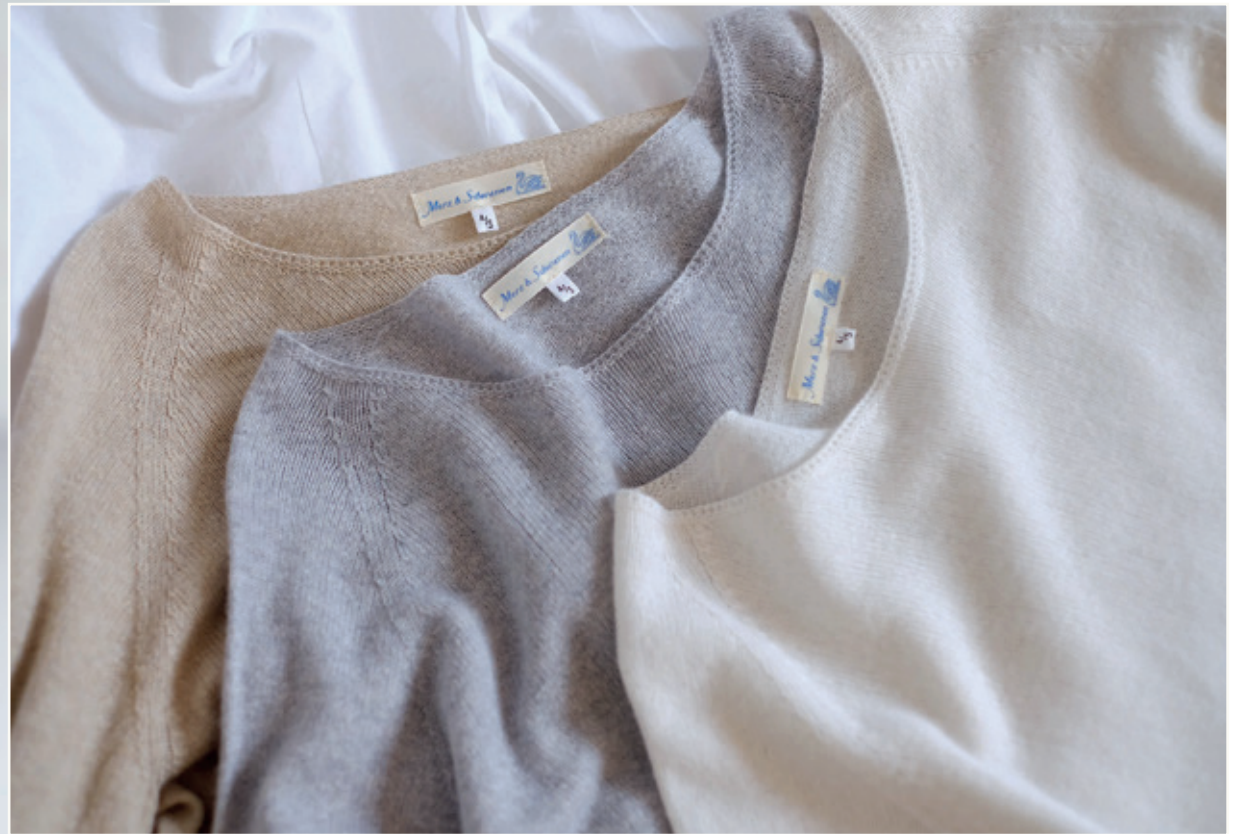
SK.CN good crew pullover