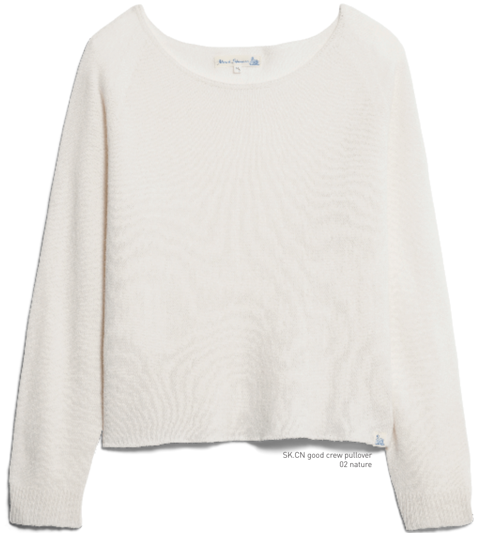
SK.CN good crew pullover 02 nature