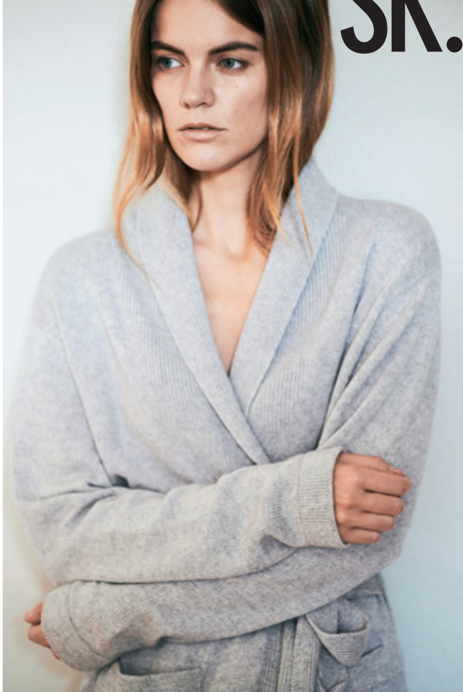
SK.JKT pocket jacket