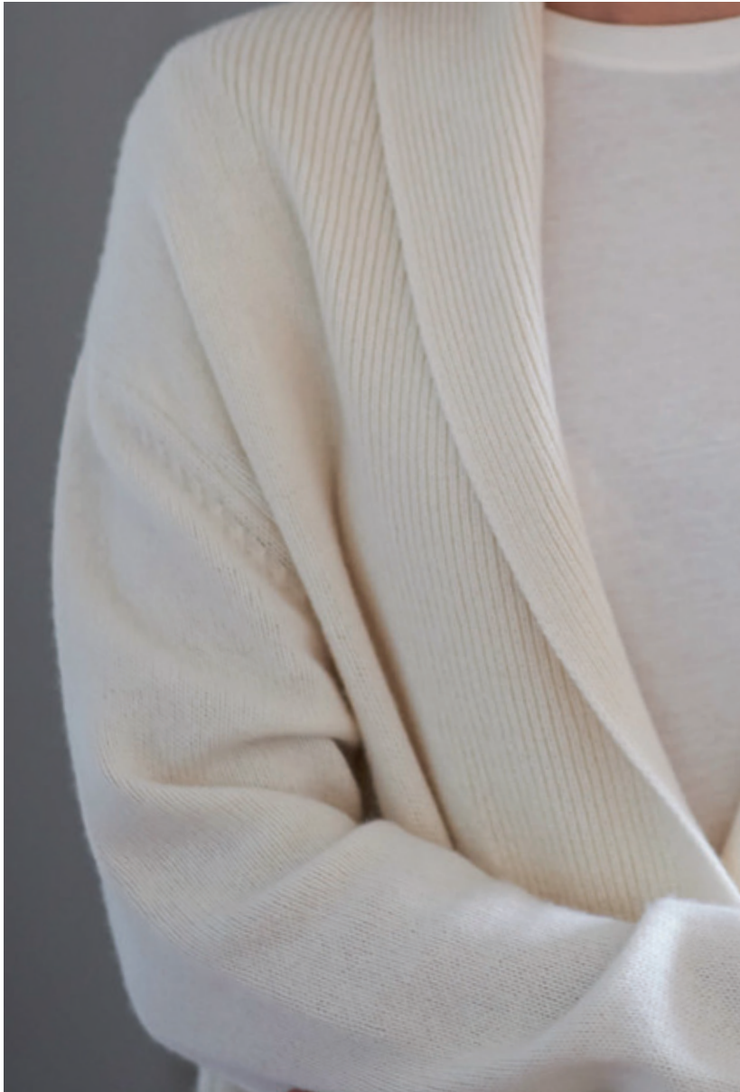
SK.JKT good pocket jacket