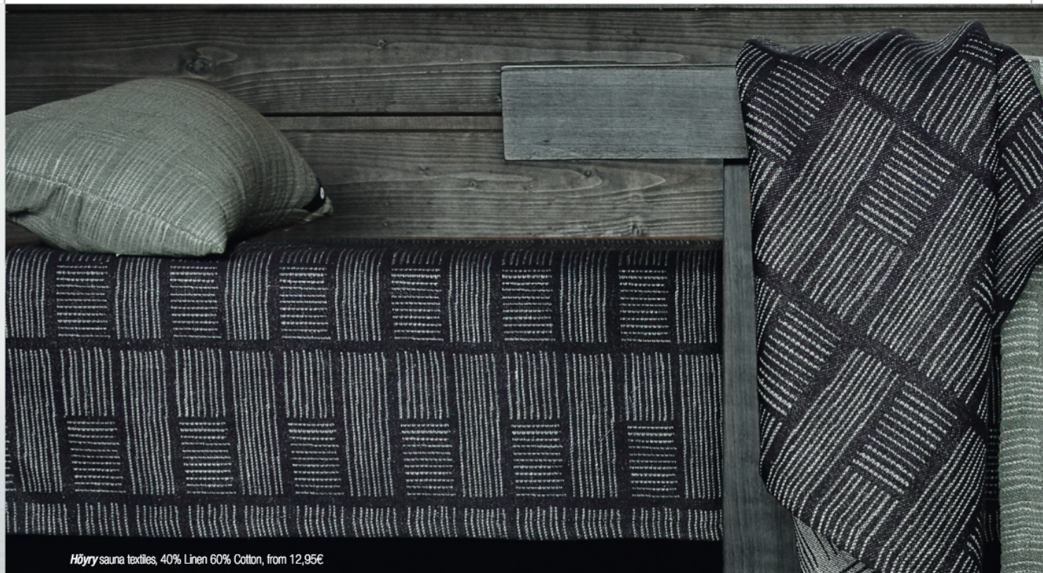
Höyry sauna textiles, 40% Linen 60% Cotton, from 12,95€